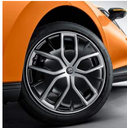
18" AERO Alloy Wheels with Two-tone Wheel Cap