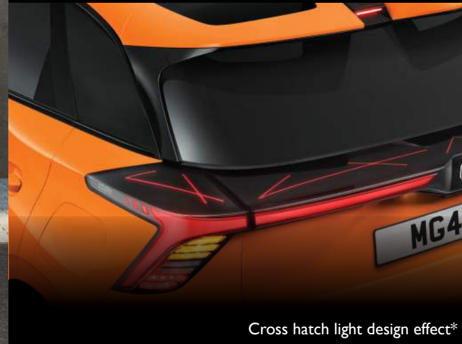
Cross hatch light design effect*