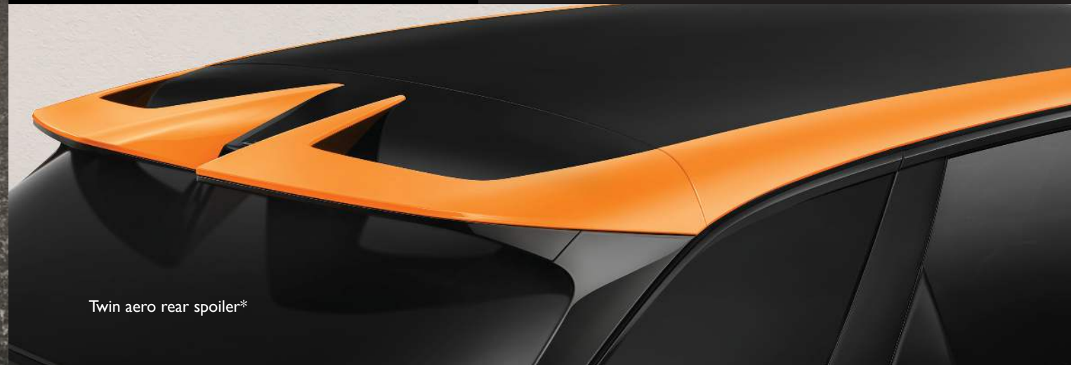
Twin aero rear spoiler*