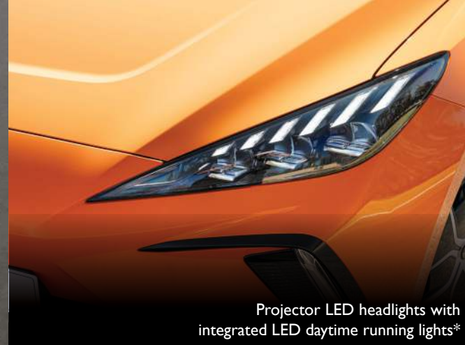
Projector LED headlights with integrated LED daytime running lights*