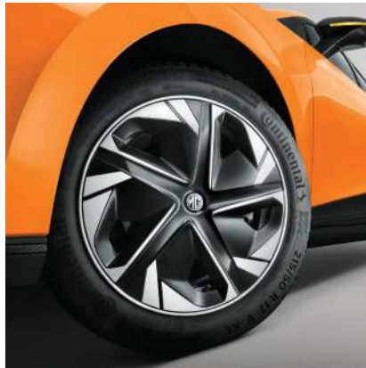
17" AERO Alloy Wheels with Two-tone Wheel Cap