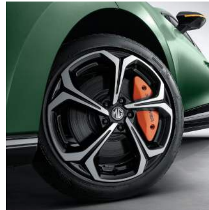
18" CYCLONE Alloy Wheels with Orange Callipers